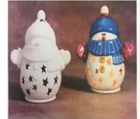
# _____ Snowman (will hold a tealight)